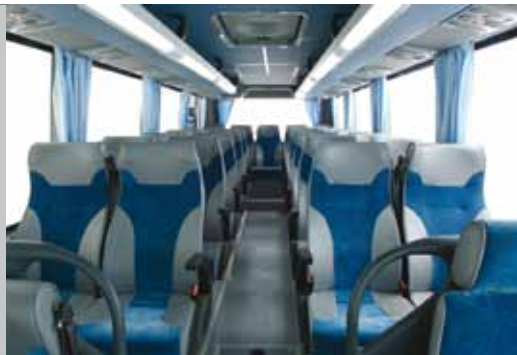
Comfortable and reclining seats with three-point seatbelts