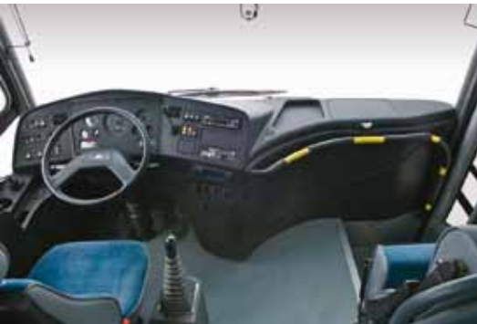
Ergonomic layout of the driver's cabin