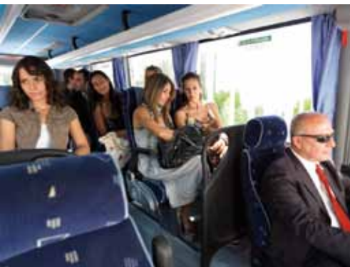
Roomy interior and attractive design