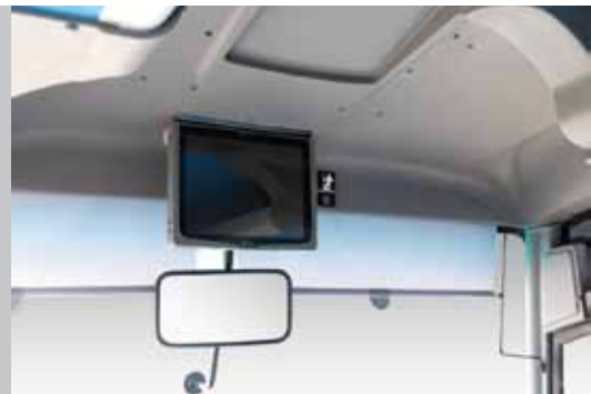
LCD monitor, TV / DVD / Mp3 player for an increased ride comfort