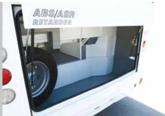
Ample & generous luggage space